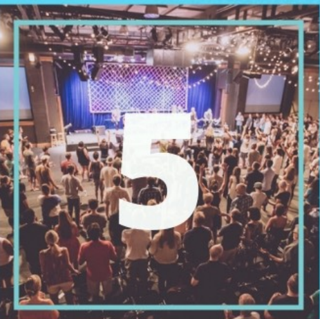
5 Rockharbor: CA