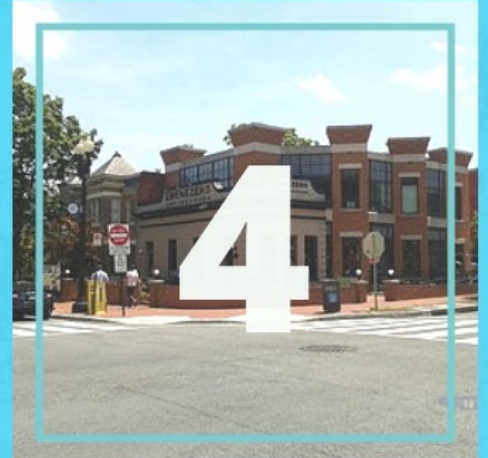
4 National Community: DC