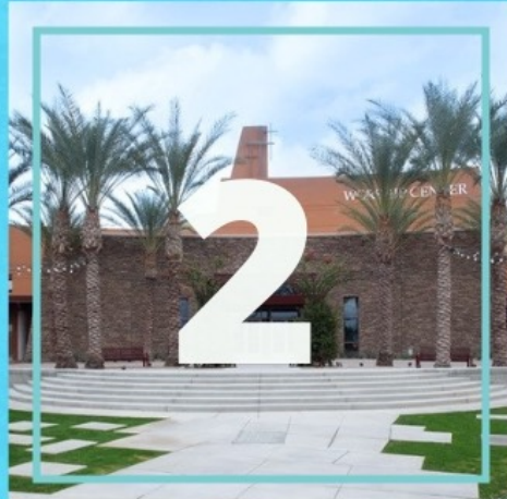
2 Central: AZ