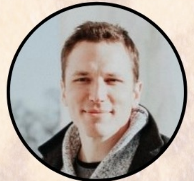
Jordan Wilson Christian Leadership Institute