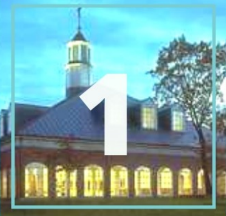
1 Christ Presbyterian: MN