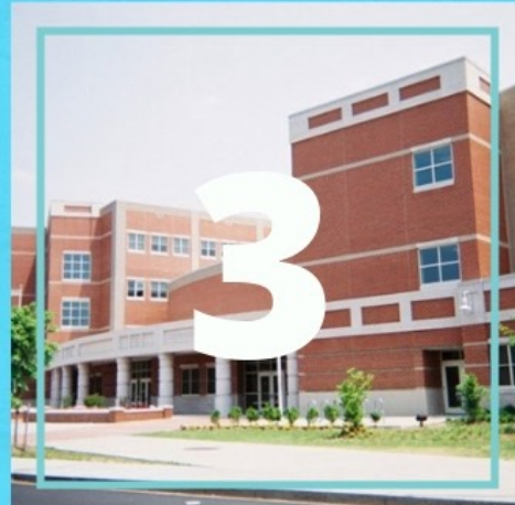
3 The District Church: DC