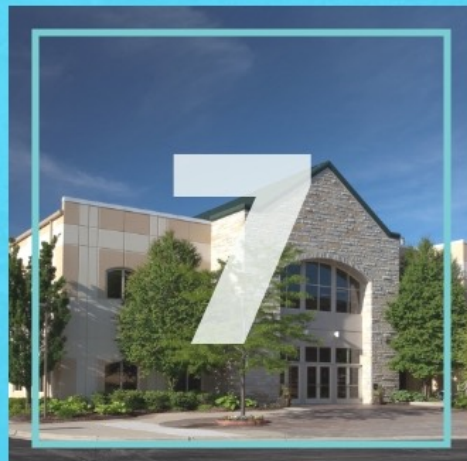
7 Parkview: IL