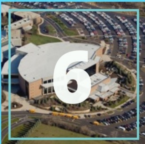
6 Willow Creek: IL