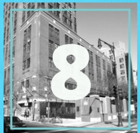
8 Trinity Grace Tribeca: NY